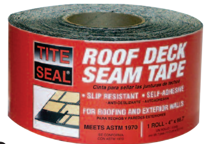
RDS467 4" x 66.7'

FOR ROOFING AND EXTERIOR WALLS Forms a Moisture and Vapor Barrier Self-Sealing Around Screws and Nails Seals Sheathing Seams Meets ASTM 1970 Easy To Use, Just Remove Release Paper and Press in Place